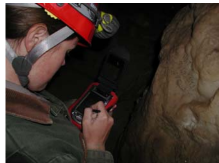
Inventorying signatures with ArcPad

ESRI created ArcPad as a simple mobile mapping solution. The software allows creation and editing of points, lines, and area features with associated attributes. It is very similar in use and function as the better known ArcView. ArcPad makes data collection fast, easy, and significantly improved with immediate data validation and availability.